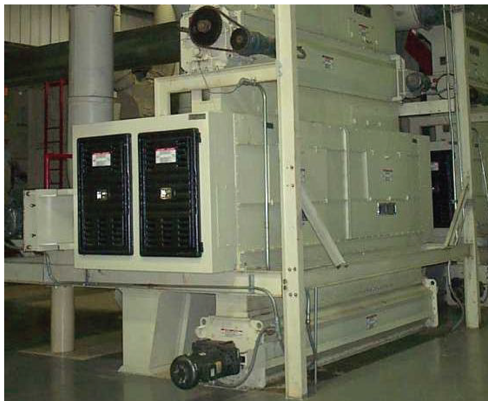
“Little Giant”™ Stick Machine (144” wide model shown with optional Disperser Hopper mounted above)