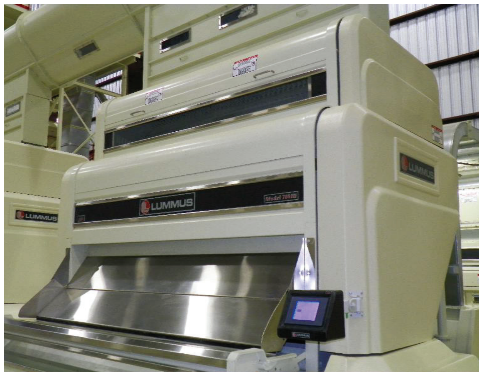
Model 700™ III Feeder (shown with Series 2000™ Digital Gin/Feeder Controls)