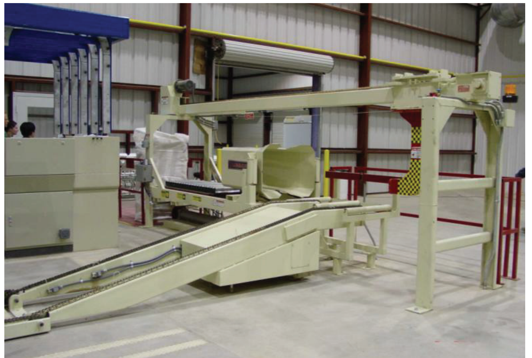
Bale Handling System for up-packing Press