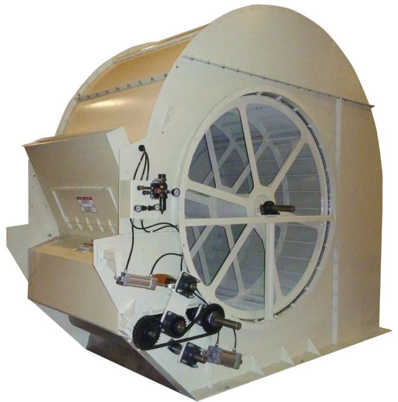
72” diameter MC™ Battery Condenser