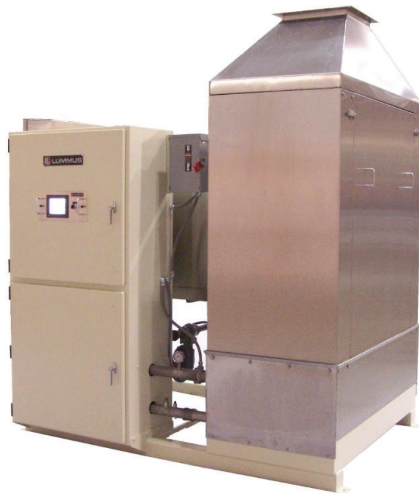
Mist-A-Matic™ Moisture Unit