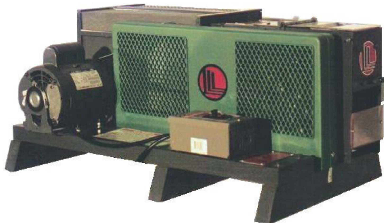
10-Saw Laboratory Gin drive side view (with guard in place)

Voltage/Frequency: 110V/220V, 60HZ or 220V, 50HZ