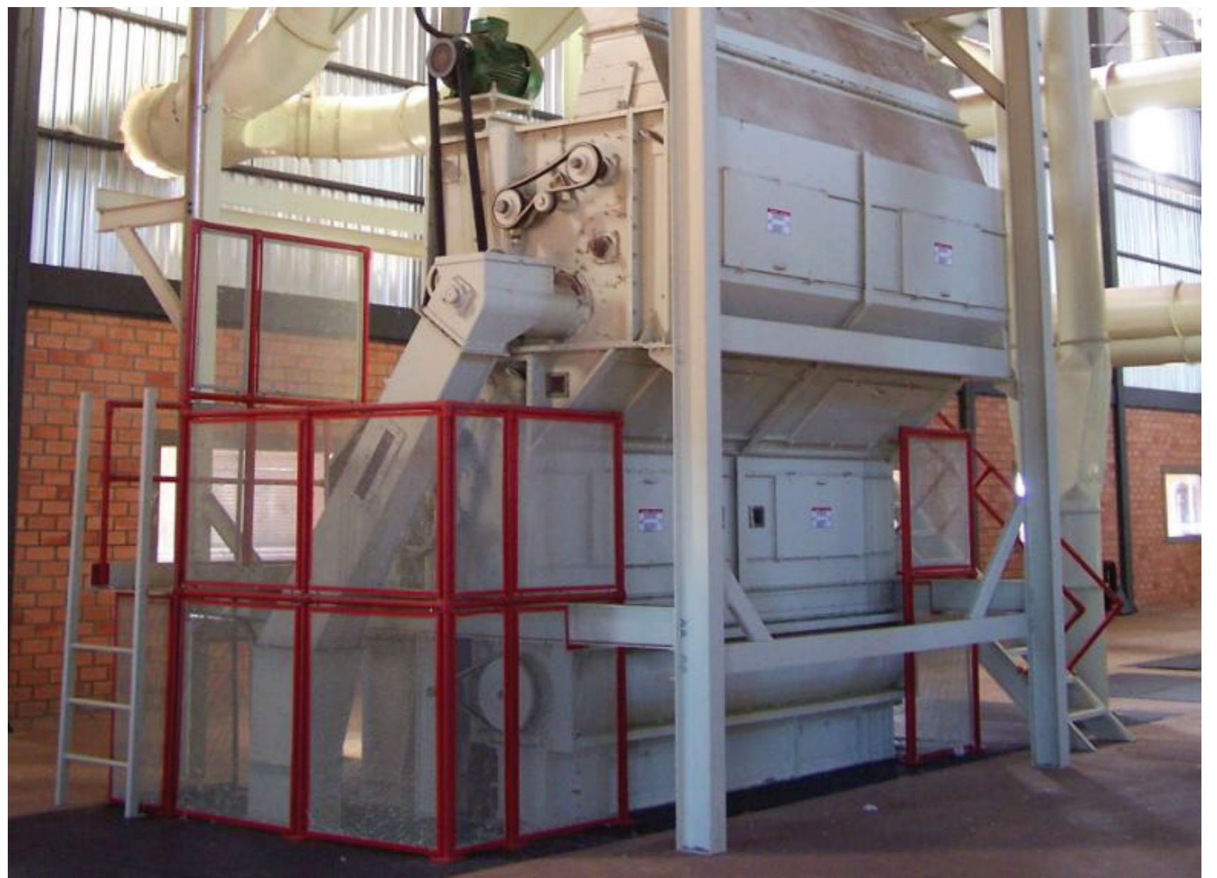
S&GH™ Machine (144" wide model shown)

In the reclaimer section, two reclaimer saw cylinders recover the good cotton from the trash. A single brush cylinder doffs both saw cylinders.