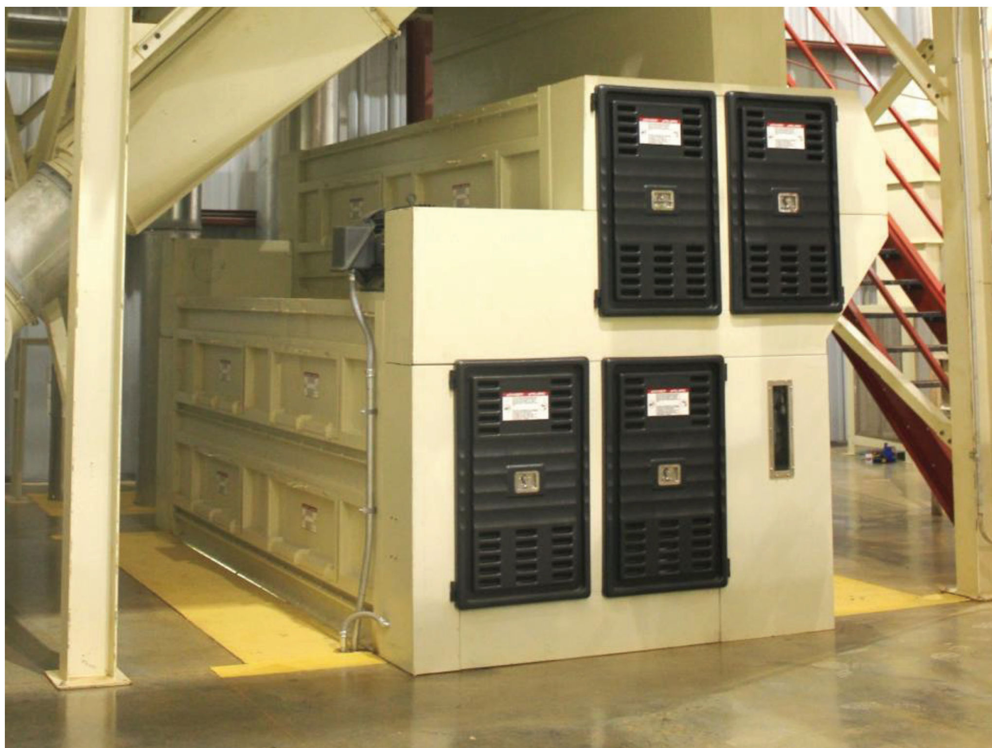
3-Saw Stick Machine