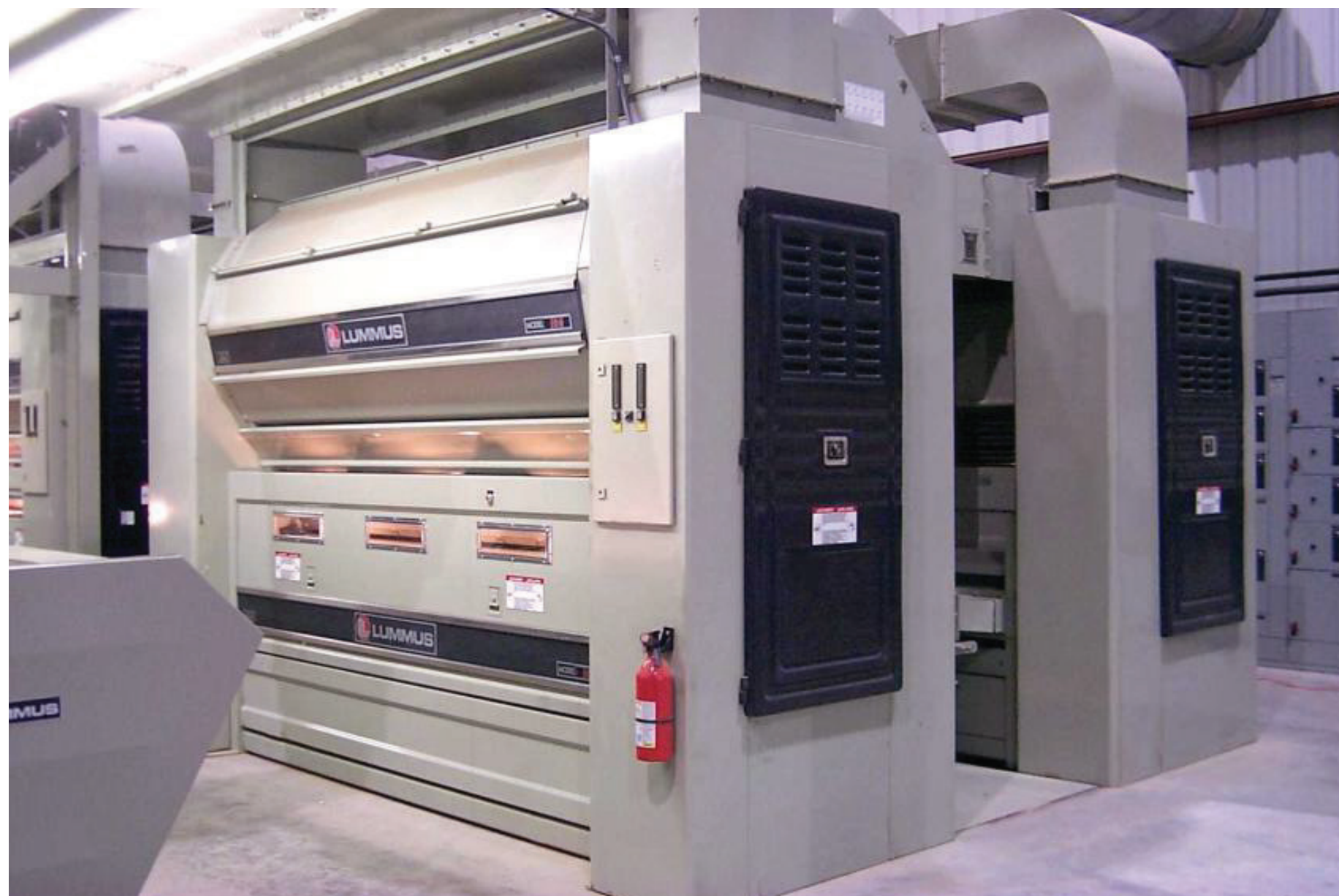
Tandem Series 2000™ Model 108 Lint Cleaners (shown with optional Modulating Feed Control)

The Lummus Modulating Feed Control maintains the correct combing ratio automatically by electronically regulating the speed of the lint cleaner feedworks to match the ginning rate. This results in far greater productivity than fixed-rate lint cleaner feedworks, which fail to adjust to ginning fluctuations, resulting in lower cleaning efficiency and greater fiber loss.