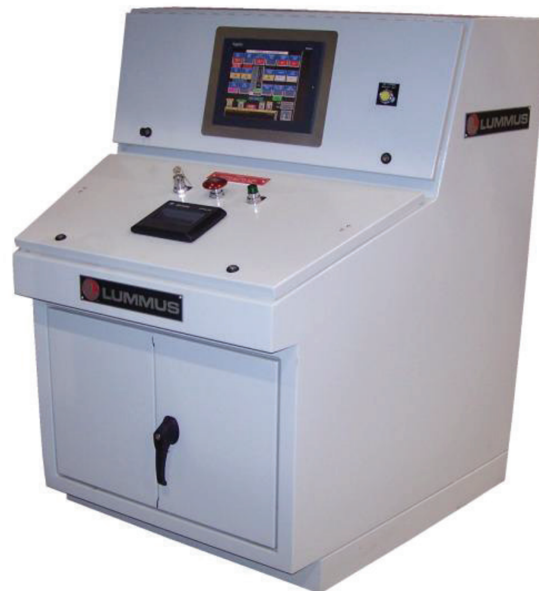
Premier™ III Series Press Console

And now every new Premier™ III Series console comes equipped with SECOMEA hardware that allows for remote access by authorized personnel for troubleshooting, process monitoring, and program downloading/uploading (facility must have hard-wired internet available to utilize this feature).