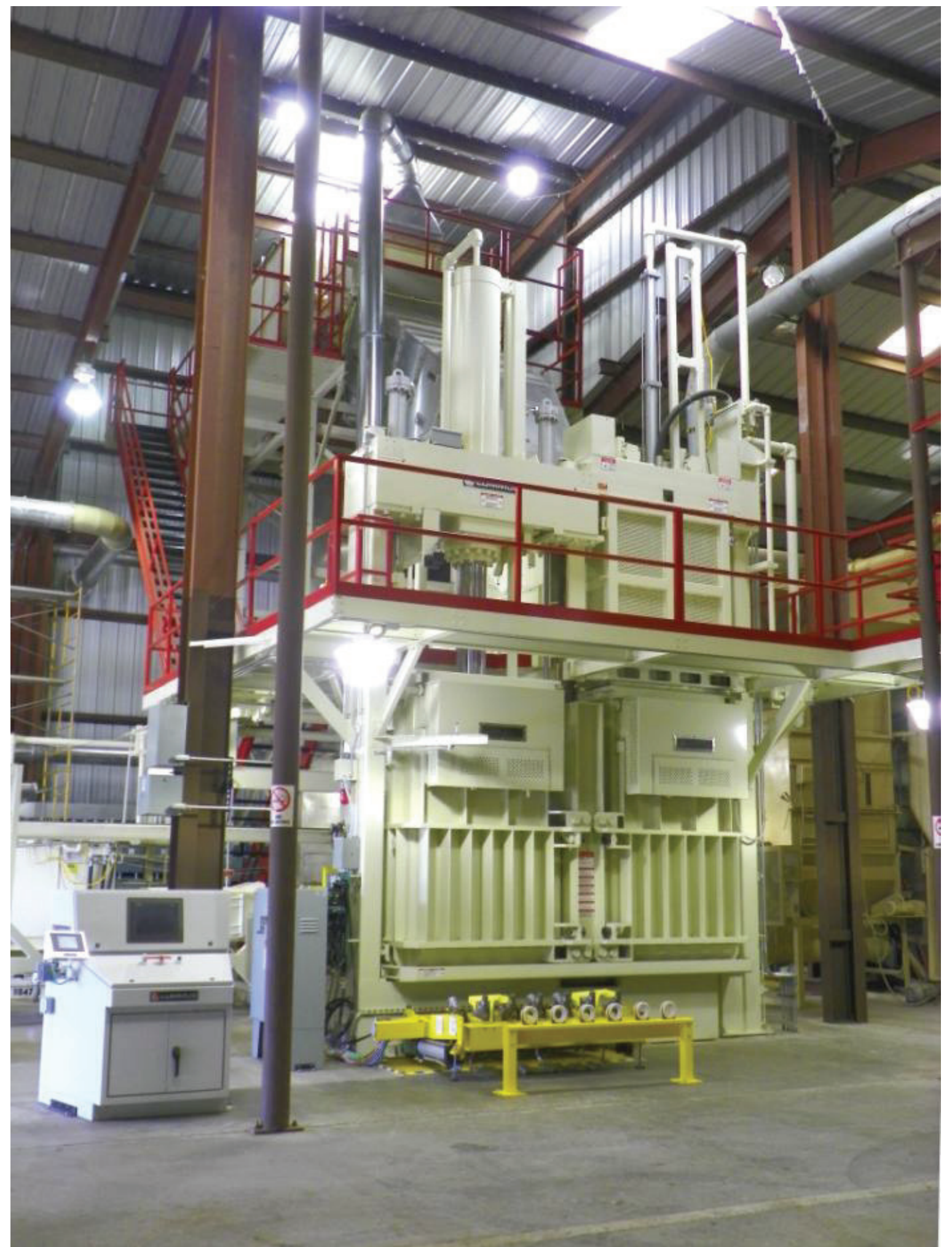
High-Capacity Lift-Box Dor-Les® Press (shown with Premier™ III Series Press Console and Bale Moisture Monitor)