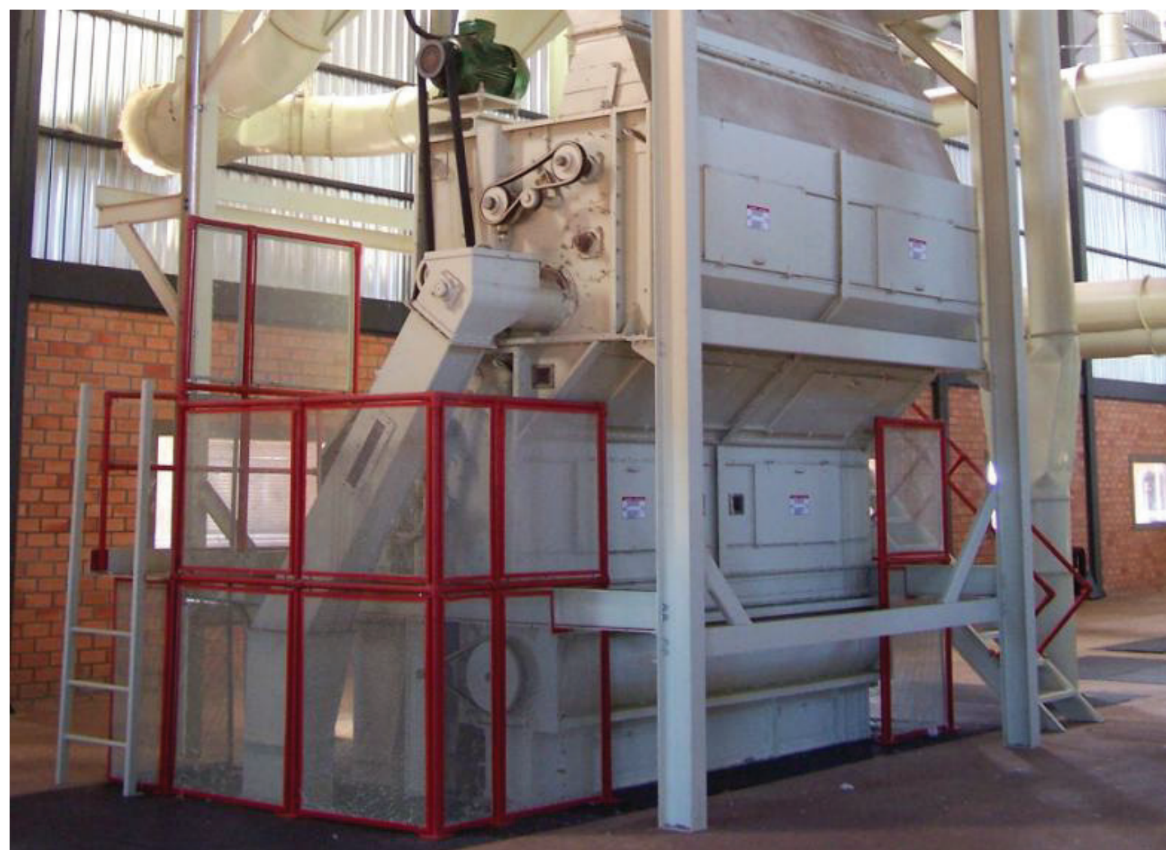
S&GH™ Machine (144" wide model shown)