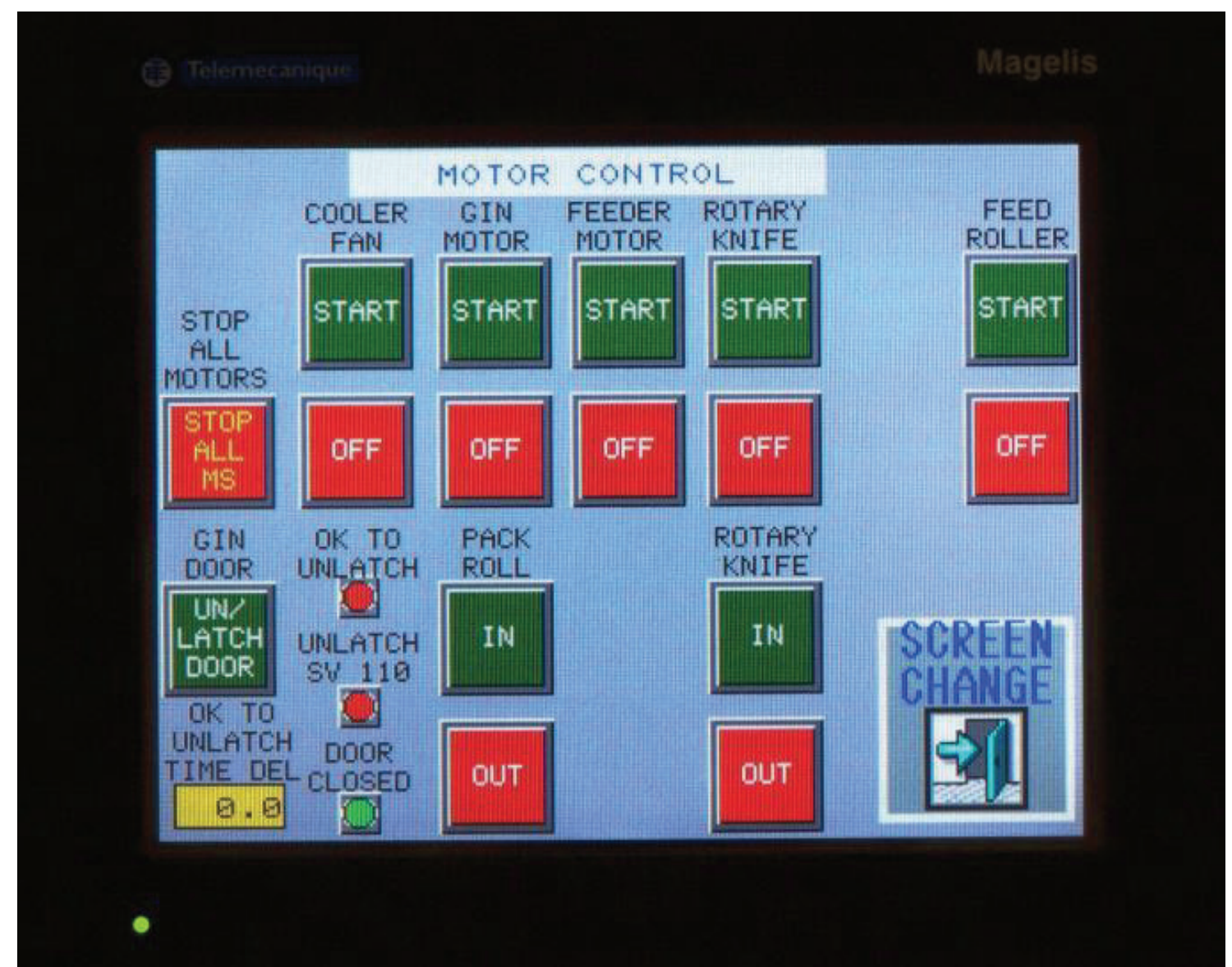
Touch-Screen Operator Interface for Feeder/Gin Controls