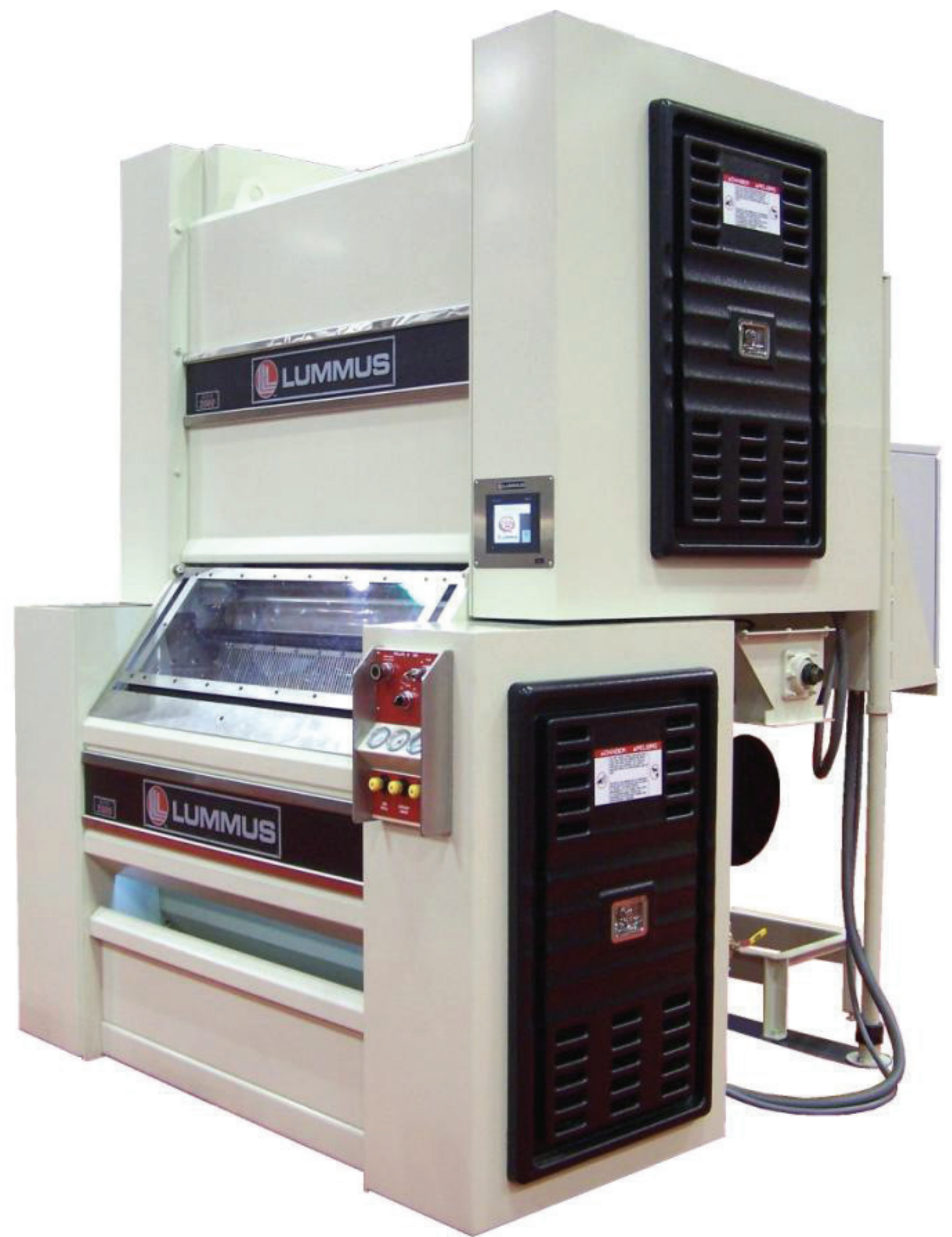
Series 2000 Rota-Matic™ Roller Gin and Feeder (multiple patents pending)