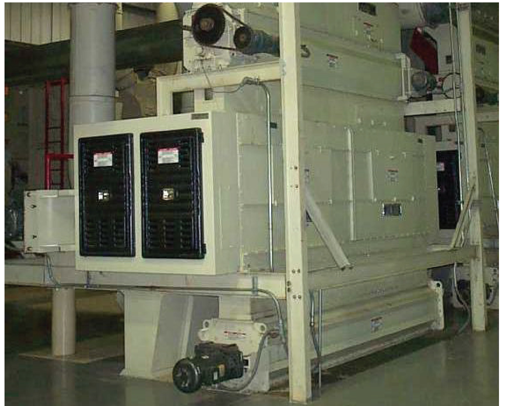
"Little Giant"™ Stick Machine (144" wide model shown with optional Disperser Hopper mounted above)