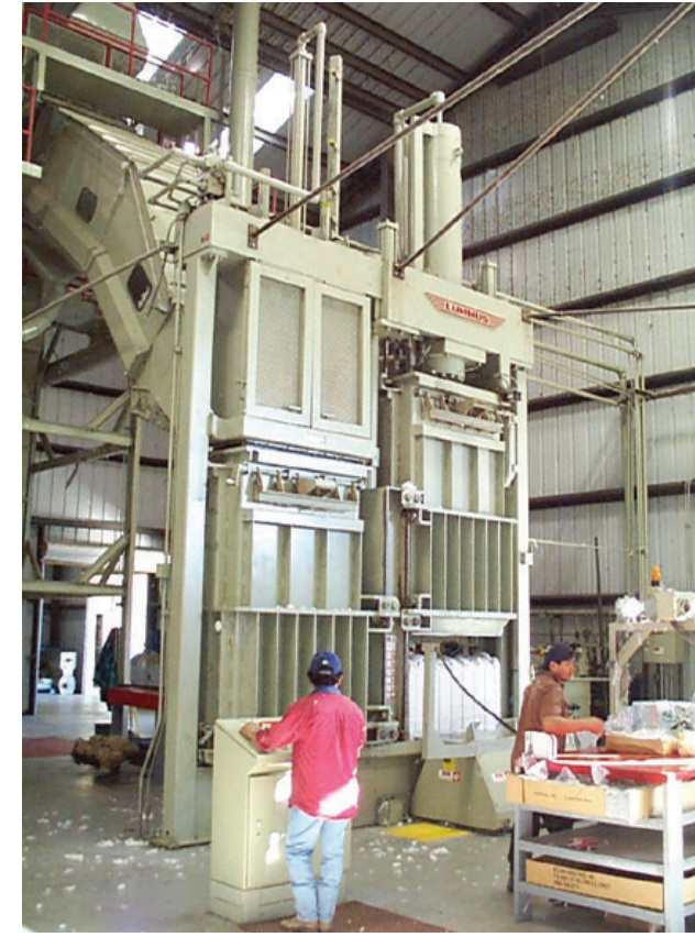
Lift-Box Dor-Les® (Standard)